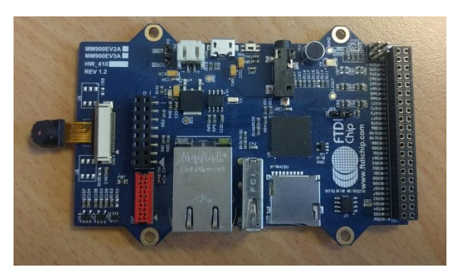
Figure 5.1 MM900EV2A Module

An MM900EV2A module with a headphone jack.