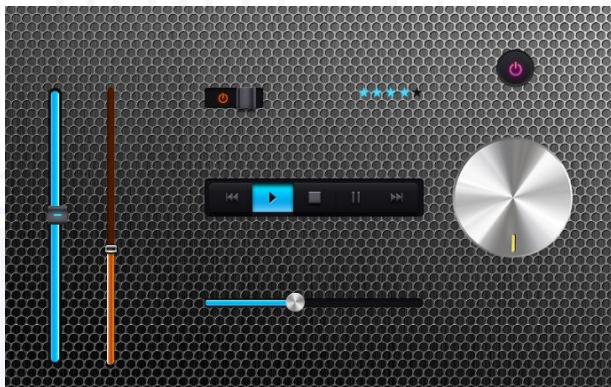
Image based Widgets

BT815 and BT816 are the new generation of EVE graphic engines from Bridgetek targeting the embedded systems market. Bridgetek provides different sample codes and tools for our customers to make vibrant screen design.