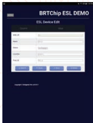
PanL Device Management